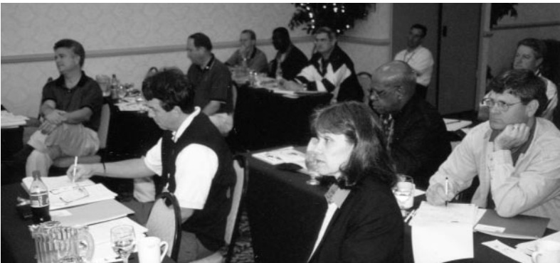
Part of the audience at Section 3 workshop session